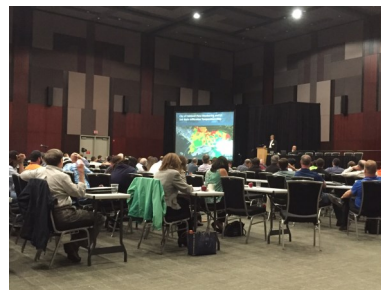
Participants, both EPA and State officials, in a technical session.

On August 15-16, 2016, US EPA Region 6 in association with WEA of Texas, the Texas Commission on Environmental Quality, and the City of Austin Water, held the "CMOM 2016": Capacity, Management, Operation & Maintenance workshop. The well attended workshop was held in Austin, Texas and allowed EPA and state regulators to