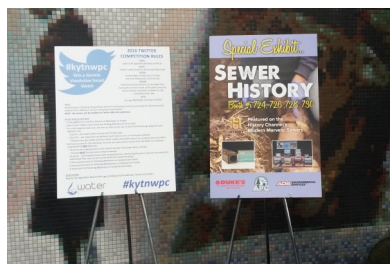
Sewer History Exhibit Promotion in Knoxville, TN.