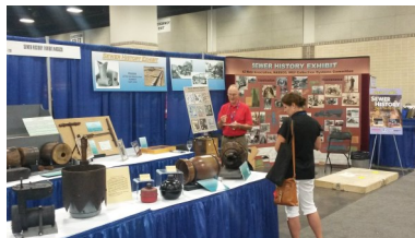
Sewer History Exhibit in Knoxville, TN.

Dave was at this exhibit and commented that this was the most interested and enthusiastic audience he has experienced to date. Visitors started showing up even before the exhibit hall opened when only 70% of the display was in place, and were still looking at it when it was being dismantled. Some visitors even assisted with the setup and pack up! The nearby vendors (Dukes, ADS, LMK, Hobas, and others) commented that we were bringing extra visitors in for them and they really appreciated our presence. The visitors loved looking at the early wood water and sewer pipes,