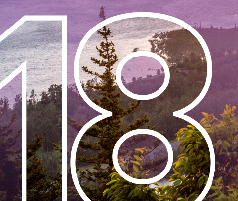
TABLE TOP EXHIBITION AND SPONSORSHIP OPPORTUNITIES

July 29–31, 2018 | Portland, OR Portland Crowne Plaza www.wef.org/DisinfectionReuse