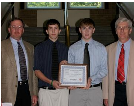
KY/TN WEA volunteers honor their state winners with an awards presentation, which can be a great photo and press opportunity for their local MA.

Shortly after the winner's announcement, each MA will receive a certificate for presentation at their winner's school. This helps promote the student's achievement and presents a photo opportunity that is likely of interest to the local press.