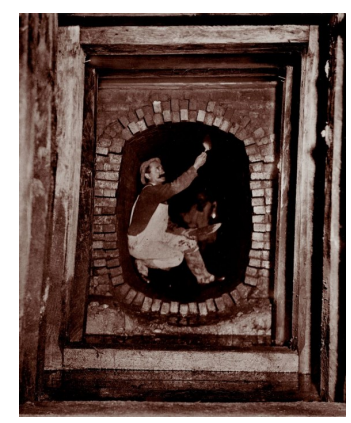
A man mortaring a sewer wall in 1880s Boston.

Smithsonian Magazine highlights "Brand New" Sewer Systems