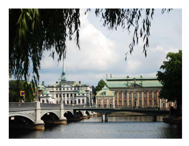
The U.S. winner travels to Stockholm during World Water Week to participate in cultural and educational events, as well as the international competition.

Students will exhibit their projects during World Water Week in Stockholm, Sweden, where they will discuss their project with a jury, researchers, politicians, and the media. They will be judged on their paper, as well as their presentation. The international SJWP prize is presented by HRH Crown Princess Victoria.