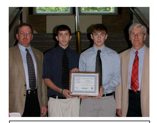
KY/TN WEA volunteers honor their state winners with an awards presentation, which can be a great photo and press opportunity for their local MA.

Optional: Arrange MA Award Presentation Shortly after the winner's announcement, each MA will receive a certificate for presentation at their winner's school. This helps promote the student's achievement and presents a photo opportunity that is likely of interest to the local press.