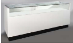
QUARTER VISION CASE