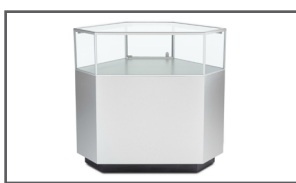
QUARTER VISION CORNER CASE