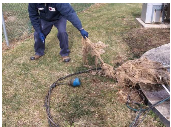
Frederick County, MD

efficiency, increasing the electrical power used by pumps, and potentially even causing pumps to malfunction and stop working completely. Workers must then perform the costly, time consuming, and hazardous task of physically unclogging the pumps. New York City alone spent more than $18 million on wipe-related equipment problems between 2010 and 2015.<sup>3</sup> Every manhour and dollar spent on removing wipe-related clogs is time and money that can no longer be devoted to other crucial projects, such as improving wastewater infrastructure. The following photos of workers removing wipe-related clogs during normal cleanings illustrate the clogs' impact on wastewater systems: