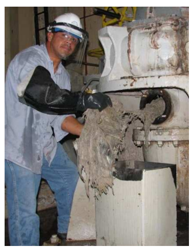
Orange County, CA