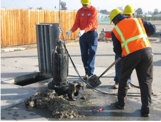
City of Bakersfield, CA