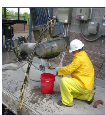
City of Vancouver, WA