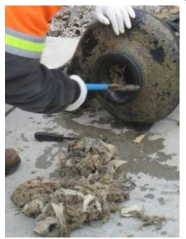
City of Bakersfield, CA