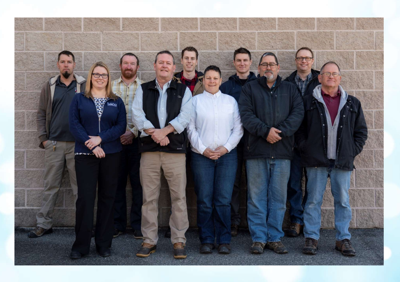
2021 Partnering & Engagement