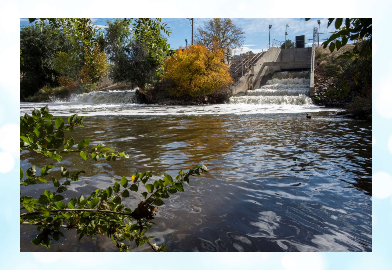
2021 Nutrient Reduction & Materials Recovery 2018 Beneficial Biosolids Reuse