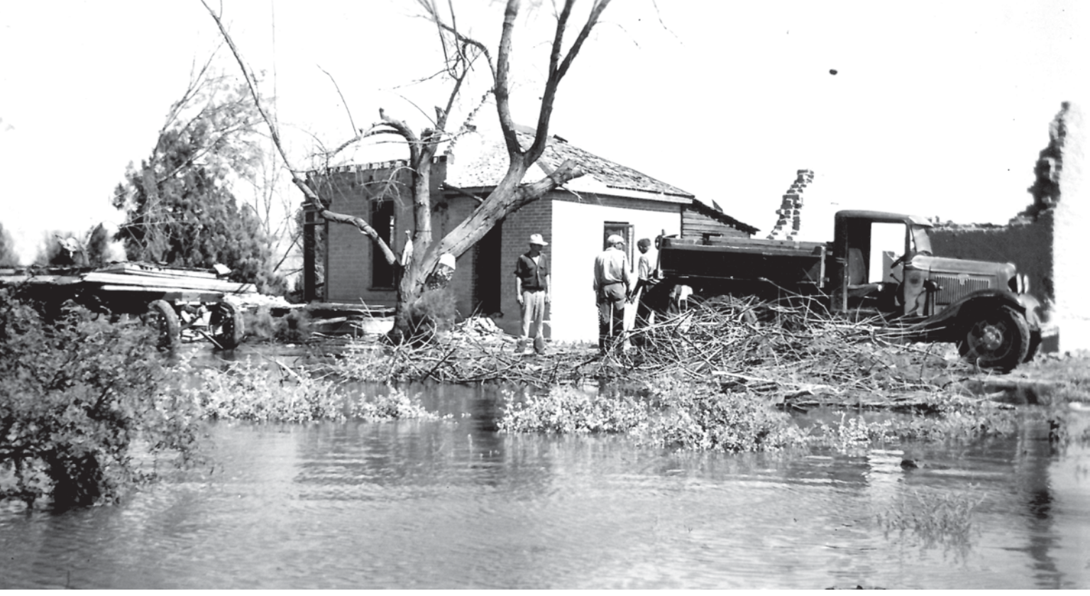
The waters of Lake Mead begin to take over the city of St. Thomas, Nev., in 1937.