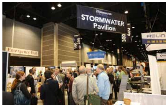
WEFTEC® 2015 attendees network during a Stormwater Pavilion reception.

"We had a great conversation about stormwater use and wastewater reuse," she said. "I'm in Southern California, so the opinions and issues in Minnesota — a very wet state — are very different. It was a great opportunity to hear a very different side of water issues."