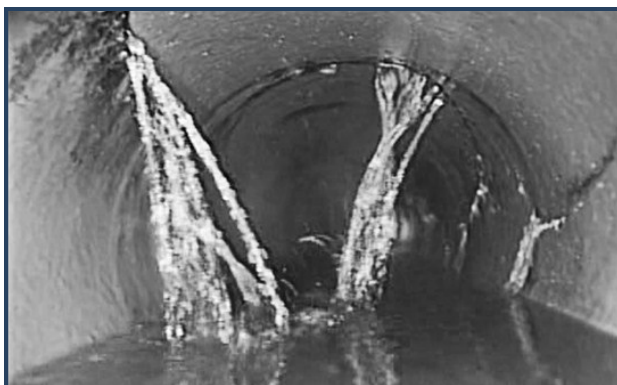
Crack with infiltration

capacity. These peak wet weather flows can also cause serious operating problems at wastewater treatment facilities. In addition, SSOs can occur during dry weather due to broken pipes or when flow becomes obstructed by debris, such as grease, roots, paper products, sand, and grit.